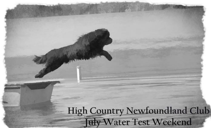
High Country Newfoundland Club July Water Test Weekend