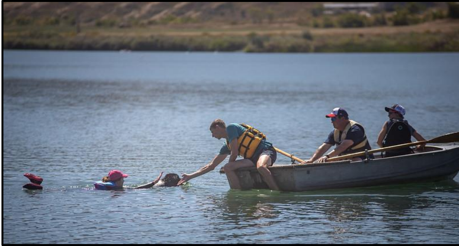
Water Test Cont'd