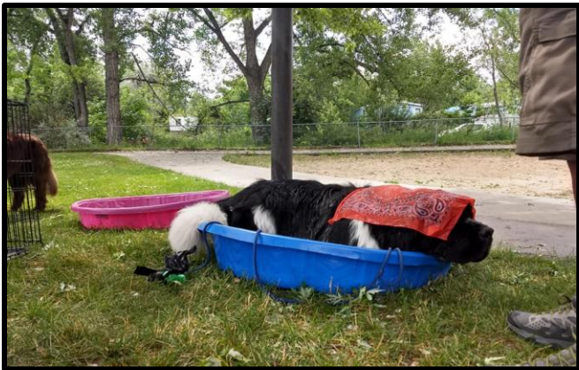
No More Silly Newfy Games...Please!