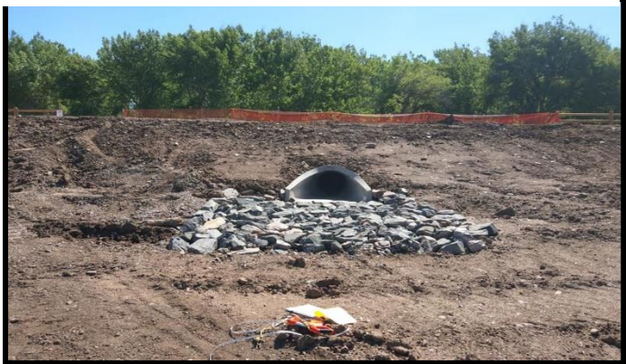
Gravel Pond is Still a Construction Site