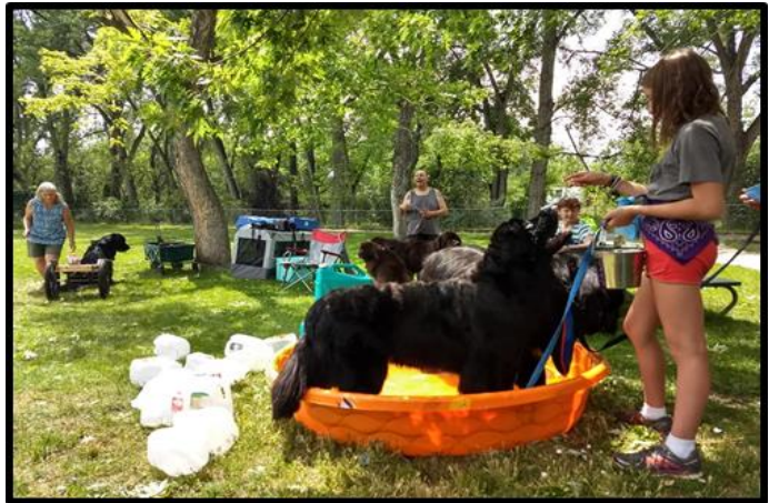
Annual FunDay and Picnic