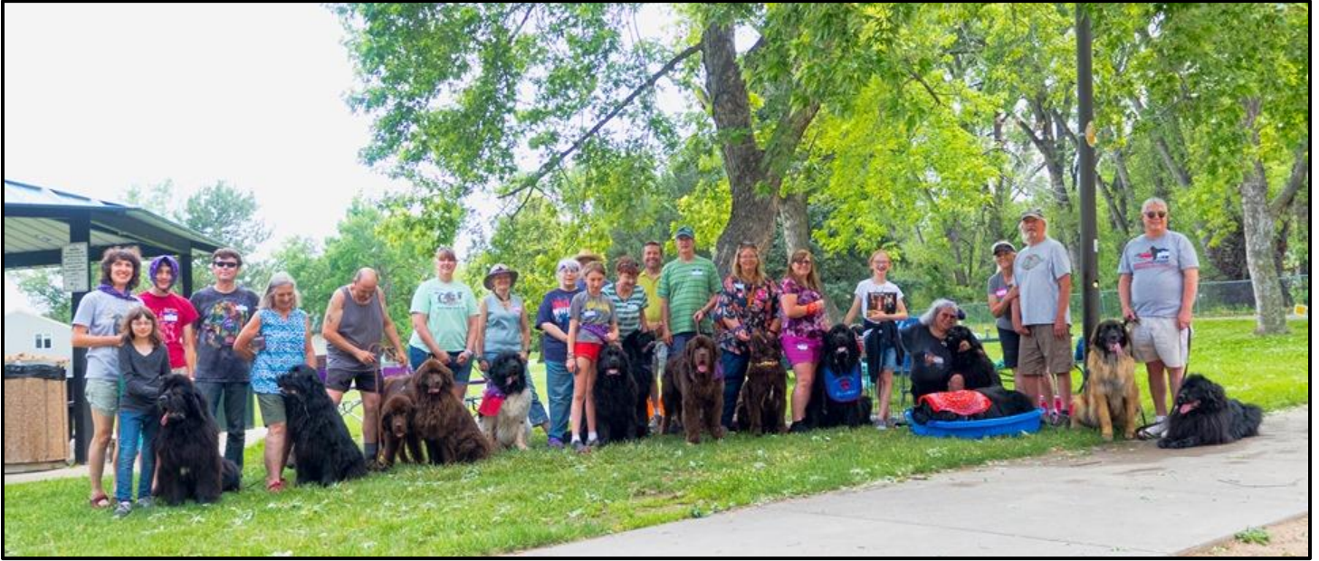
A group photo of a few of those who attended the FunDay and Picnic. Wish we would have gotten an earlier picture with everyone.

Fun times were had on July 6th when HCNC hosted our Summer Picnic. There was a great turn out of members, and we welcomed many potential new members and their Newfs. We could not have asked for better weather! It was not too hot, and the afternoon thunderstorms stayed away. Evangers sponsored our picnic by making sure everyone who attended went home with at least one package of puppy treats!