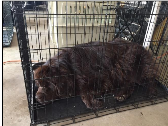
Why am I always last to go?